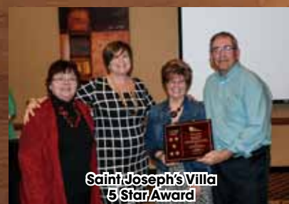
Saint Joseph's Villa 5 Star Award