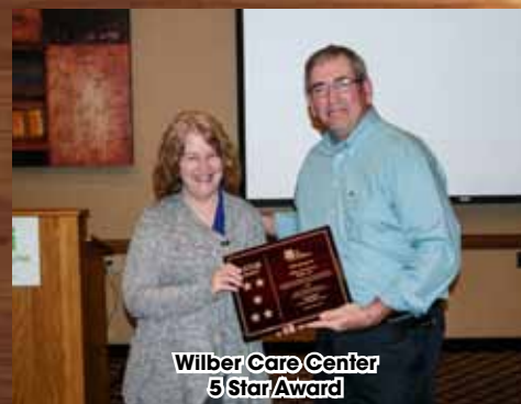
Wilber Care Center 5 Star Award