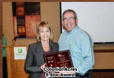
Colonial Acres 5 Star Award