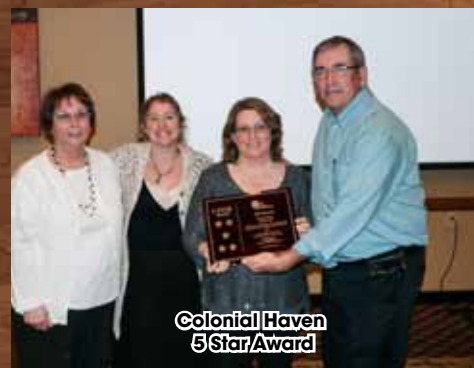
Colonial Haven 5 Star Award