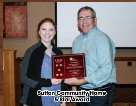
Sutton Community/Home 5 Star Award

Other 5 Star Awards: Skyview at Bridgeport in Bridgeport, NE Bertrand Nursing Home in Bertrand, NE Platte County Memorial Nursing Home in Wheatland, WY