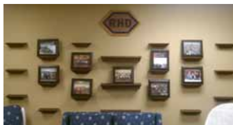
Lincoln, NE Office

Look at all of the empty shelves in the picture above, those can be filled by pictures from your facility! Please e-mail Ashly (ashly.lannin@rhdconsult.com) or upload to the forum any photos you want of your facility framed at the Lincoln office or put on our website.