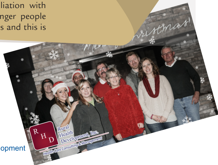
RHD Rural Health Development, Inc. Health Care Consulting & Management