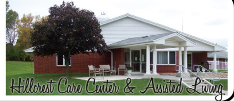
Hillcrest Care Center & Assisted Living

702 Cedar Street Laurel, NE 68745 Phone: 402-256-3961 Fax: 402-256-9522